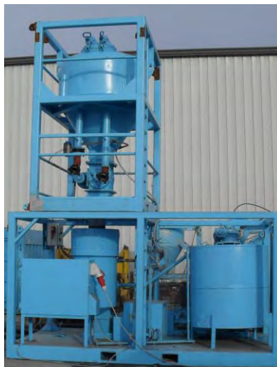
Assembled 10V Grout Mixer

All of the equipment is mounted in an offshore lifting frame and is fitted with a certified sling set.