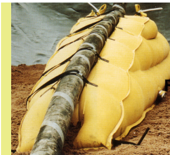
J-Tube grout bag