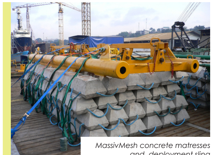
MassivMesh concrete mattresses and deployment sling